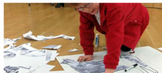
Introduce the Work of Lubaina Himid

Week 2 & 3: Draw- Use Negative Space and the Grid Method