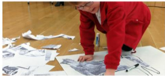
Introduce the Work of Lubaina Himid

Week 2 & 3: Draw- Use Negative Space and the Grid Method