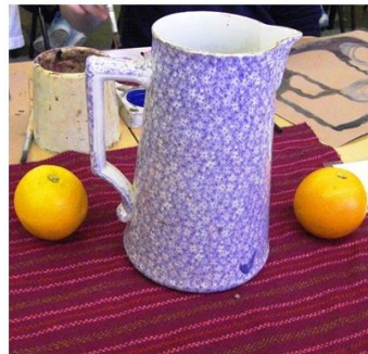
Learning to see